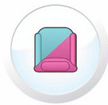
good but beware